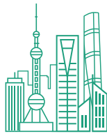
Shanghai T +86 2 152 281 122